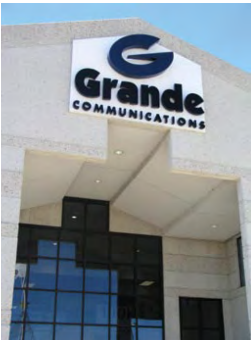
Grande Headquarters, Austin TX

Grande uses the 802.1p packet prioritization and 802.1Q-in-Q VLAN tagging capabilities in Zhone TNE Network Extenders to handle packet forwarding and QoS. QoS can be managed by the service provider, the customer, or both for flexibility in service. Zhone's application of open interfaces and standard Ethernet practices enables Grande to leverage the EoTDM network with Grande's other Ethernet access networks.